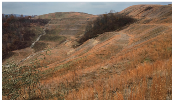
Photo of a West Virginia surface mine, courtesy of the Kanawha Forest Coalition.

The coal industry across the seven Eastern states has lost about 27,000 jobs over the last 10 years – a decline of about 46%. Addressing the reclamation backlog could put a substantial number of people back to work. If the remaining 633,000 acres in need of reclamation were reclaimed, this would create between 23,000 and 45,000 job-years across the Eastern states. Proper mine reclamation could have significant positive economic impacts, and contribute to methane mitigation, carbon sequestration and climate change resilience.